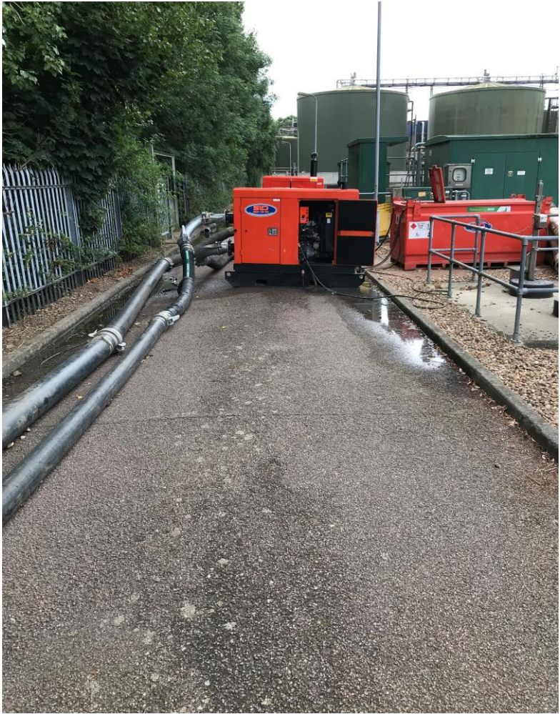
OUTFALL OF FINAL EFFLUENT PIPEWORK SETUP